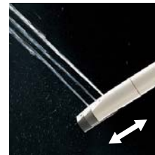
Gentle Massage Feature with Cycling Motion