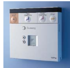
Convenient Remote Control